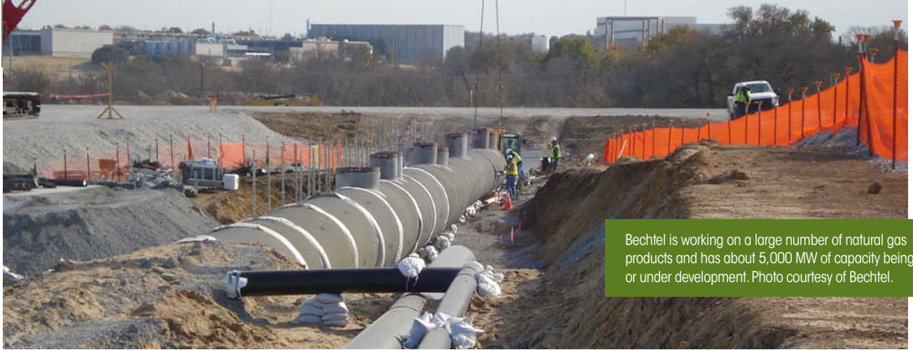
Bechtel is working on a large number of natural gas products and has about 5,000 MW of capacity being built or under development.

gas products are you working on or have completed recently?