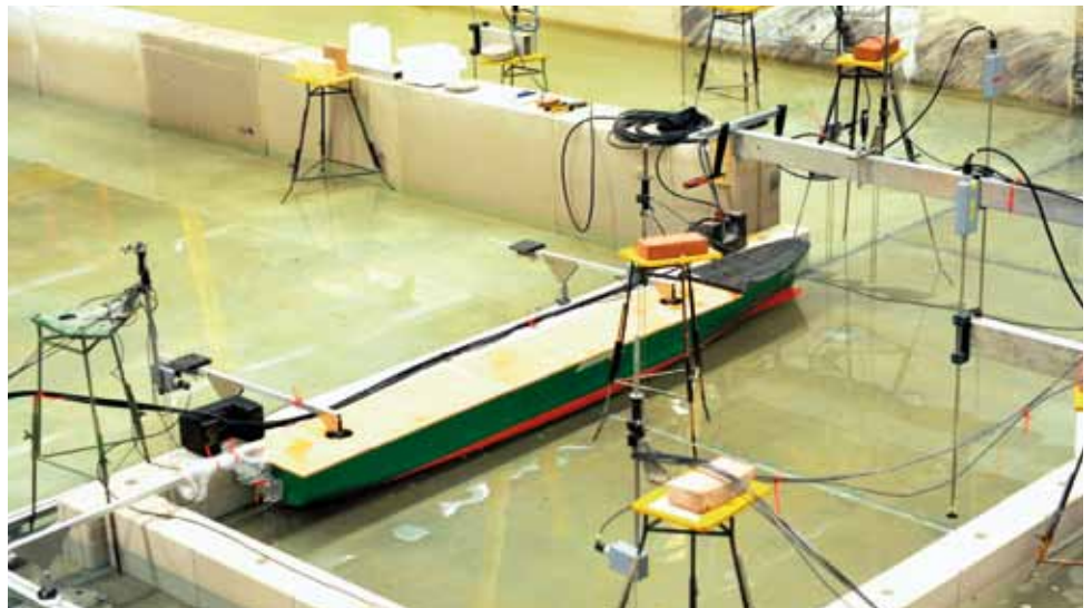
Following model tests of the effects of passing ships at Delft based research institute Deltares, the project has now begun full-scale testing at the Port of Rotterdam.