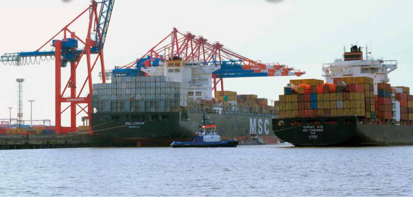
Wash can cause moored ships to come loose and also affects the safe loading and unloading of vessels.